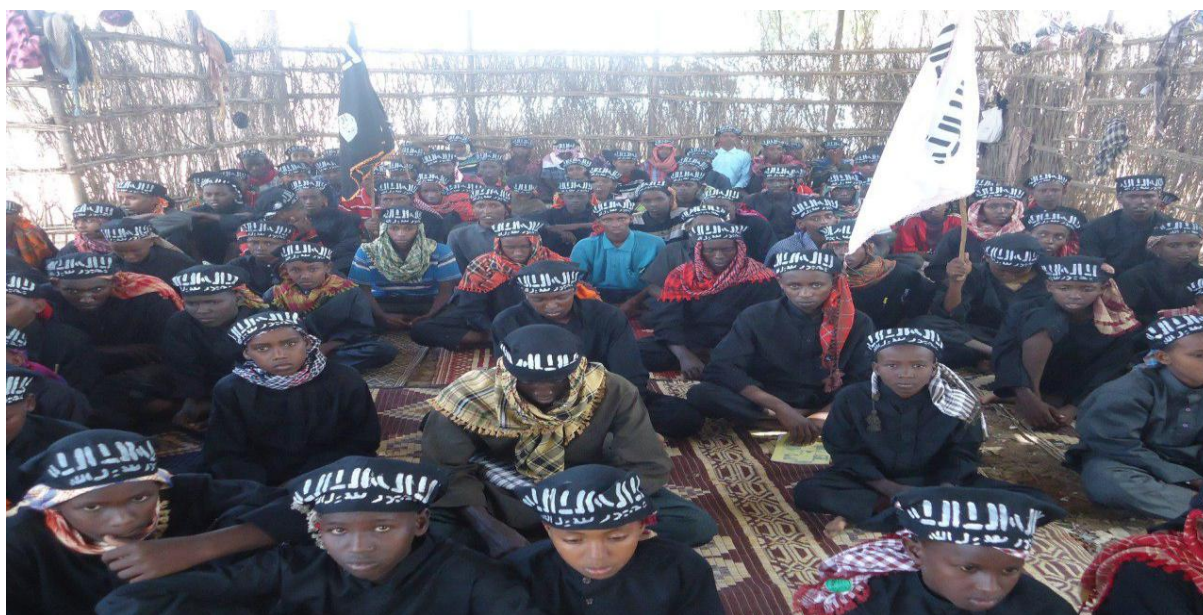
Figure 1 Children at a graduation ceremony in 2017

In late 2016, Al-Shabab banned Somali-style Islamic schools known as Dugsi Quran that it does not control in its territory. 2 Instead, it created an Islamic educational system that is directly run by the group, and known as 'the Islamic institutes' by its subjects. The Islamic schools are based on clan boundaries and paid for by clansmen, under strict supervision by local district wali (district commissioner) and Hesba (AS police). Clans are allocated quotas of children aged 8-15 that they have to hand over to the special institutes that AS creates for each clan and also pay for the education provided. For instance, in late 2017, a clan living in the area of Baidoa was told to create a second institute and pay 50k USD - paid annually - and provide 100 children to be taught 'Islam'. 3 Clan elders are forced to see to it that their fellow clansmen pay the money and hand over the assigned number of pupils. Elders that refuse or are seen to be slow to respond have been imprisoned, according to defectors.