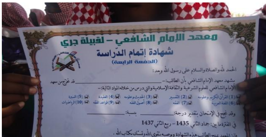
Figure 2 A child holds his graduation certificate in 2016

Parents trying to protect their children from the AS recruitment system have resorted to desperate measures. According to residents in AS-controlled territory, some clans have started buying children from poorer clans to take the place of their children. For instance, in one central Somalia AS-controlled town, residents were ordered to provide 40 children. The families that could afford to raised $1,000 each to buy 13 children from southern Somalia to replace their children. This has in effect created a child slave trade, with the tacit approval of AS.